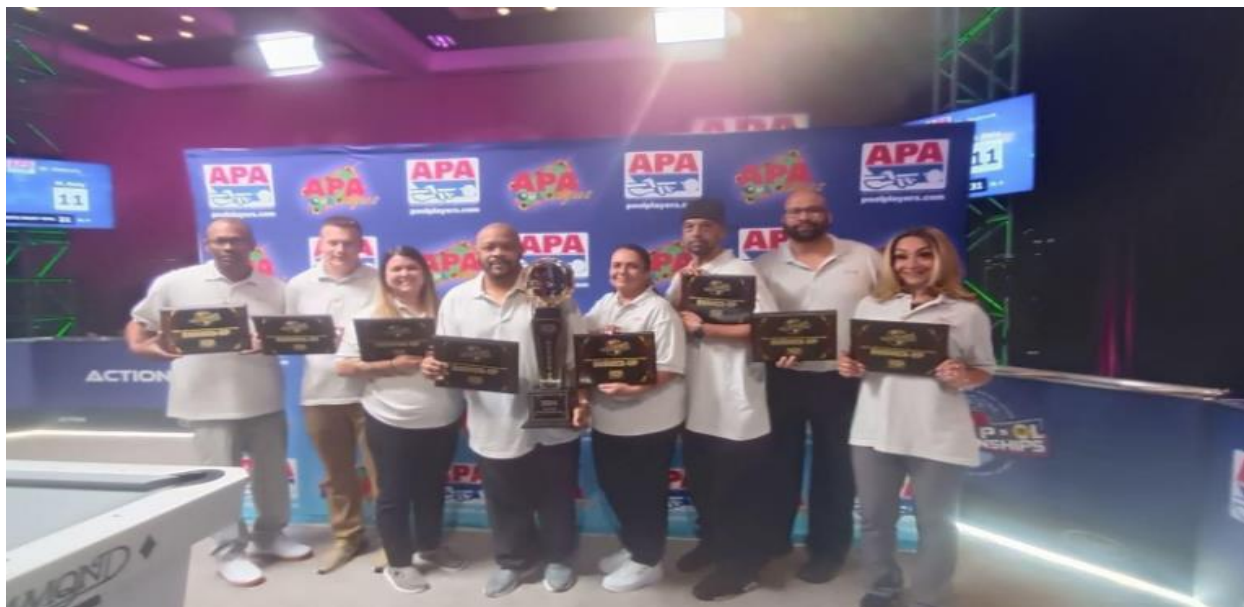
Jeannette Aerie#844 members came in 2 nd place out of 650 teams at the APA 9 Ball Tournament held in Las Vegas.